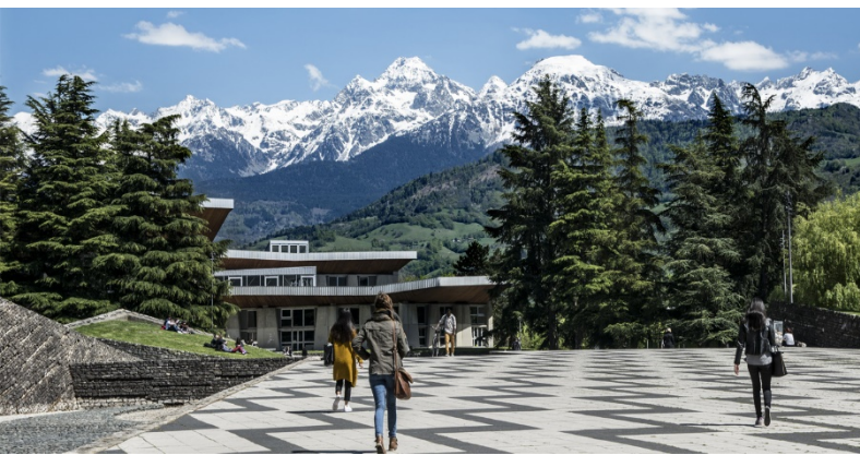
CAMPUS DE VALENCE